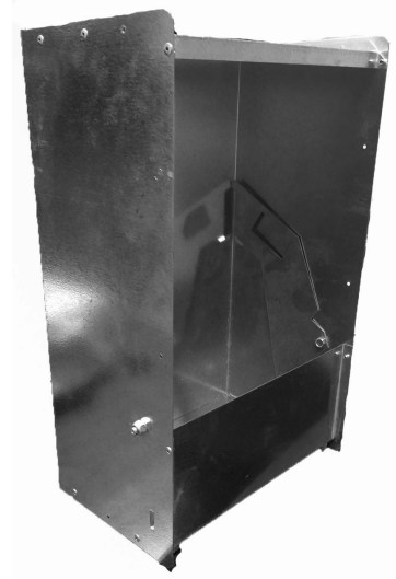
Parts Included Back Box (1)