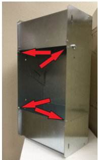
B: SHEET METAL SCREW LOCATIONS TO SECURE SIDE SECTION; ONE ON EACH SIDE