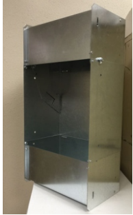
BACK BOX FULLY ASSEMBLED