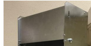
← Side Section

Sheet Metal Screws (4) - For Back Box Assembly