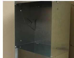
← Center Section