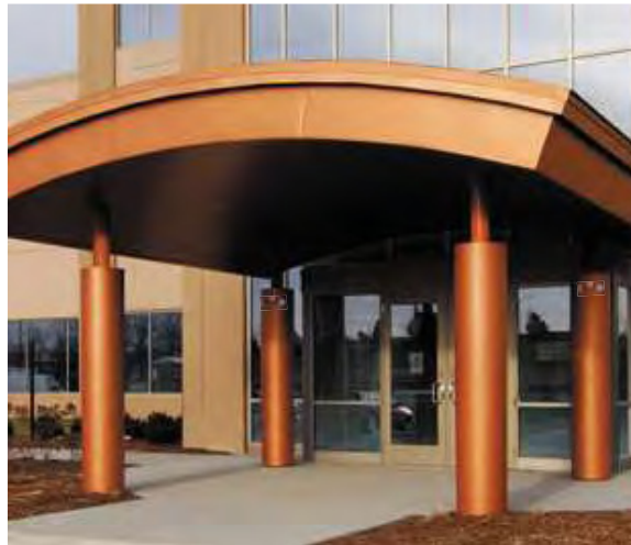
Commerical Office Building