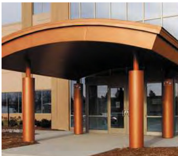
Commercial Office Building